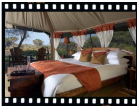
Elephant Bedroom Camp, our home away from home in Samburu Game Reserve.