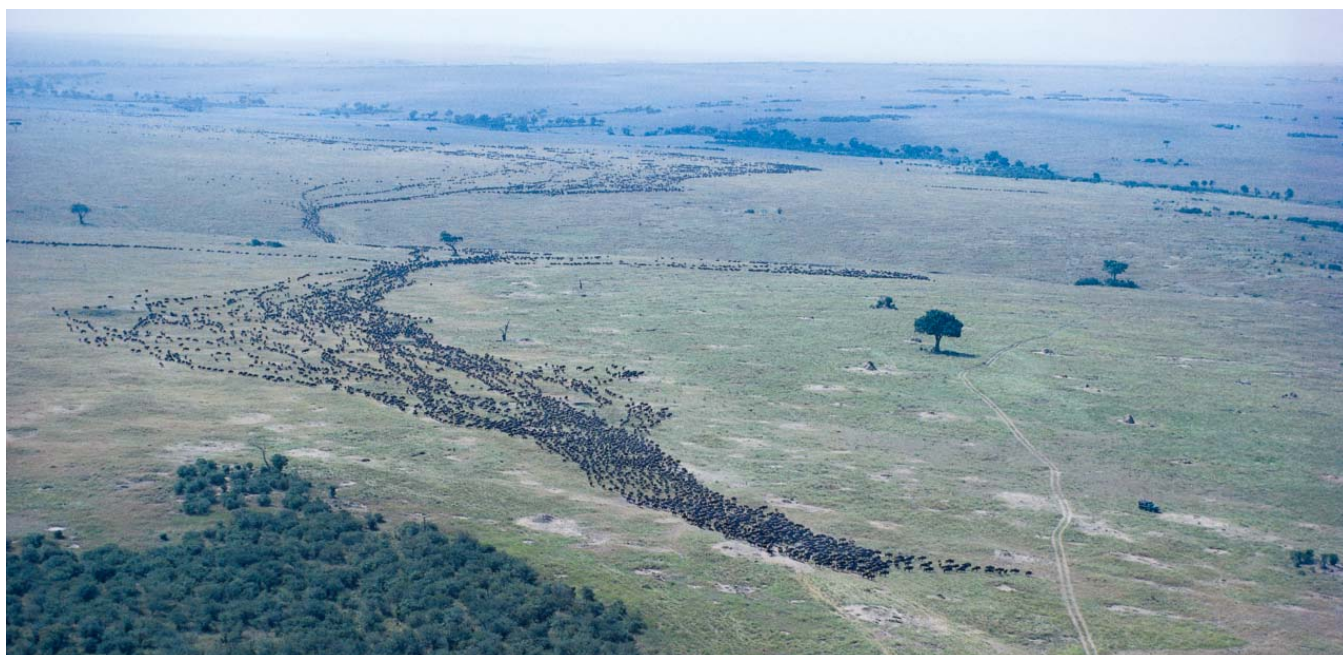
A million wildebeest cross the Serengeti and the Masai Mara. But who's counting?