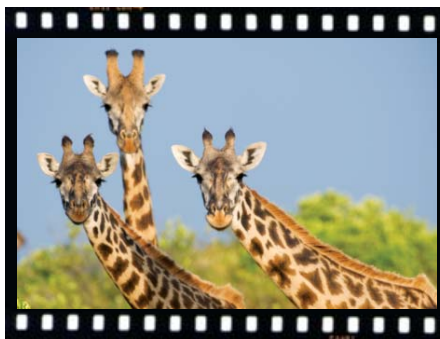
Masai giraffes keep an eye on the visitors.