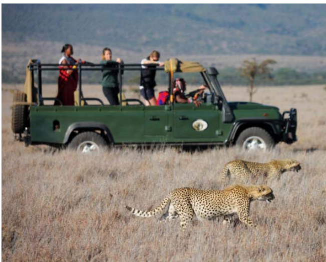
R. Crusoe gets you up close and personal.

You've come for the wildest wildlife, and the East African nation of Kenya won't disappoint. We visit two of Kenya's finest game reserves, Samburu and the Masai Mara. Samburu was one of the two reserves in which conservationists George and Joy Adamson raised Elsa, the lioness made famous in the book Born Free . The Masai Mara is known all over the world for its tremendous herds of wildebeest, zebra, and other big game—and the predators who follow them in search of a meal. How's that for wild?